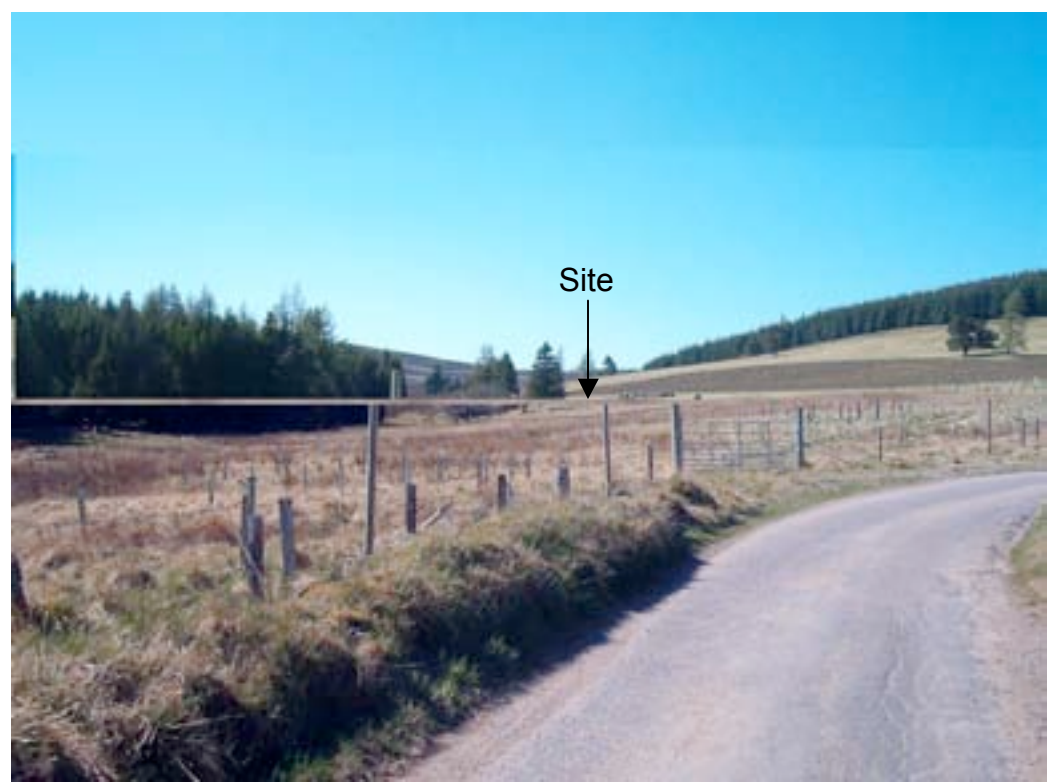
Fig 2 View towards site showing access through gate from public road