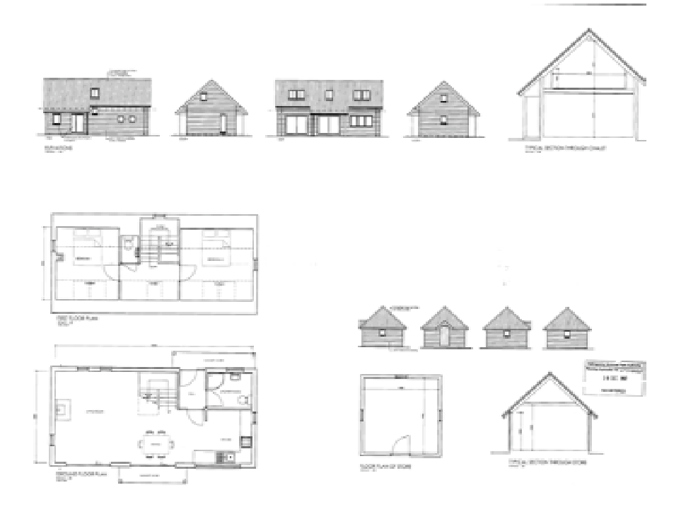
Fig 4 Elevations and plans for chalet and outbuilding