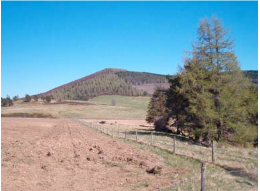
Fig 3 View of site (between ruin and trees) looking towards public road